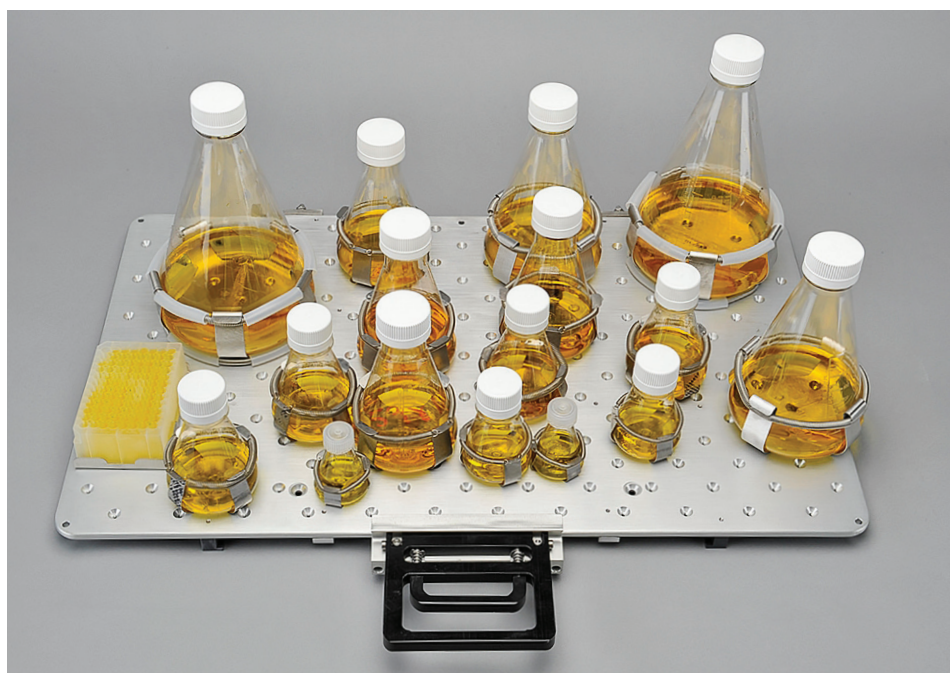
Figure 2. Removable platforms are recommended for all orbital shakers for greater flexibility and to facilitate regular cleaning and disinfection. A universal platform will accept a wide variety of clamps.

Before installing flask clamps, check whether a flexible spring must first be installed. If your clamps require a spring, it must be used, because without it the flask will not be secured