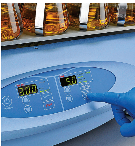
Figure 3. A shaker should offer a clear display which allows viewing of all parameters simultaneously and allows individual, precise control.

If you are connecting a data monitoring and remote alarm module, now is a good time to set that up. This is also time to become familiar with the different alarms indicated by the shaker and how to correct them. If your shaker allows, you can change the alarm setpoints and triggers—such as high and low temperature